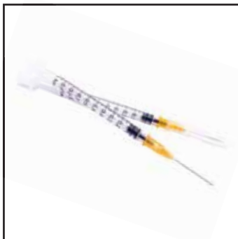
Disposable Hypodermic Syringe with Needle (Luer Lock/Luer Slip)