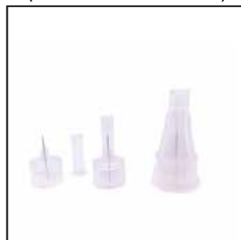
Insulin Pen Needle (non-safety)