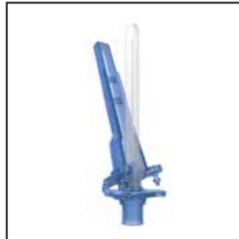
Safe-T-Clip™ Safety Needle