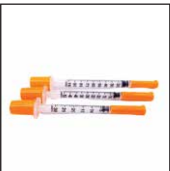
Conventional Insulin Syringe (non-safety)