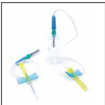
Safety Blood Collection Butterfly Type (with or without tube holder)