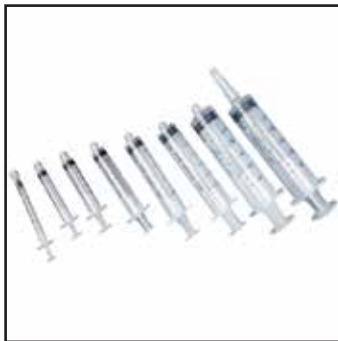
Disposable Hypodermic Syringe (Luer Lock/Luer Slip)