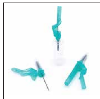
Safe-T-Clip™ Safety Blood Collection Needle Pen Type (with or without tube holder)