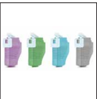
Safety Lancet (Infant, Heel)